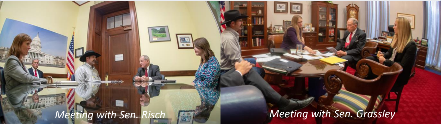
Meeting with Sen. Risch