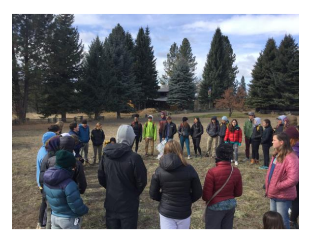
Morning briefing before going into the field