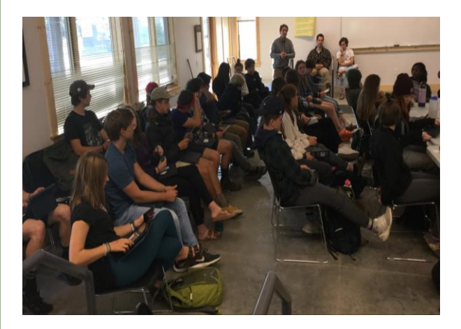
Students preparing for the field day