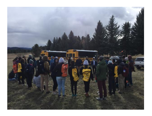
Gathering at the end of the day to submit data and close out